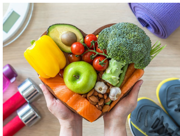
Eat Healthy, Be Active is one of the many programs that our community nutrition instructors use to help participants make better food choices and increase physical activity.

The adults in my most recent Eat Healthy, Be Active program arrived on the first day of class with sodas and energy drinks in hand. Ironically, one of our activities for the day was using real sugar and a measuring spoon as a visual of how many teaspoons of sugar can be found in all kinds of drinks, including soda and energy drinks. I had each participant take turns counting out teaspoons of sugar and dumping it on a plate and guess when they were finished. When they saw the final results for soda and energy drinks, they were shocked. I reminded them that if they drank multiple sugary beverages in a day they would need to multiply the amount of sugar by the total number of drinks. Also, sugary foods would add to the amount of sugar intake. Everyone agreed they would cut back on the number of sugary beverages they consumed. One participant said that she went from drinking 2-3 sodas each day to 2 sodas per week after she saw how much sugar is in one can of soda.