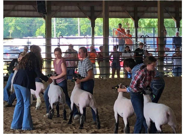
Youth show their lambs to a livestock judge at the 2022 Ionia County Free Fair.

Ionia 4-H youth participated in many programs during 2022. For those who chose to do an animal project, the culminating event was and always is the Ionia County Free Fair. In 2022 many 4-H youth brought their animals to the fair to be shown, judged, and sold to the highest bidder. There were more than 1000 animal entries including, beef, cavies, dairy, dairy feeders, dairy goats, market goats, poultry, rabbits, sheep, and swine. Other youth participated in the Fair by creating beautiful still exhibits and preparing jams and baked goods. Through club networks each youth works on projects according to their particular interests. MSU Extension offers programming throughout the year for the youth to develop specific skills related to their projects like showmanship, or skills for life after 4-H such as public speaking and entrepreneurship.